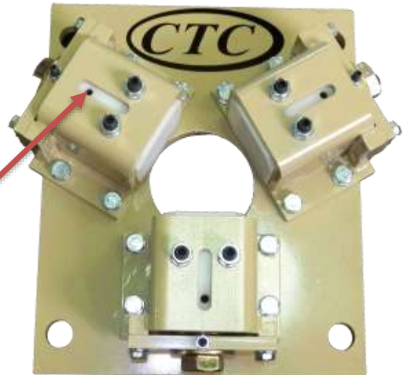
(1) ASSEMBLY SHOWN