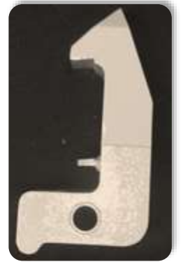
LOWER PLATEN HOOK

"SIMPLER DESIGN ELIMINATES COSTLY WASHER THAT CAN GO FLAT"