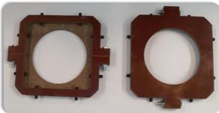
CENTER COLUMN UPPER BEARING

"TWO PIECE DESIGN FOR EASIER REPLACEMENT"