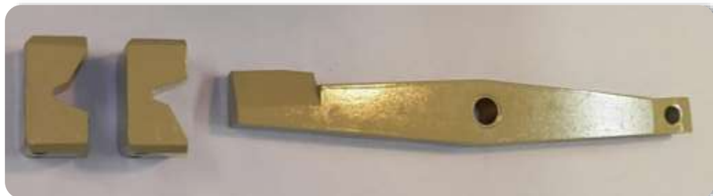
VEE STYLE LATCH BAR & SEATS