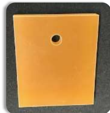
BOX SHOCK PADS

"TWO PIECE DESIGN FOR EASIER REPLACEMENT"