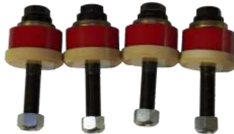
REPLACEMENT SYSTEM FOR SPRING WASHERS

"SIMPLER DESIGN ELIMINATES COSTLY WASHER THAT CAN GO FLAT"