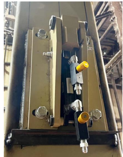
INSTALLED VIEW ON TRAMPER END COLUMN