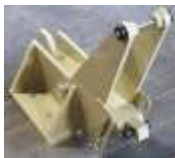
LATCH BAR BRACKET