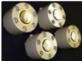
PLATEN JACK CYLINDERS