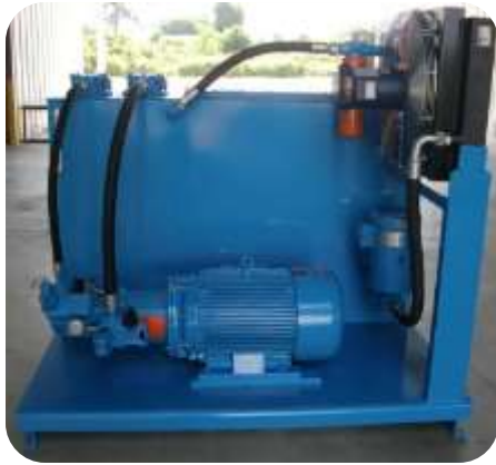
50 HP BOOSTER PUMP