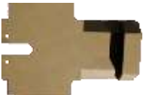
INSIDE LIFTING BRACKET