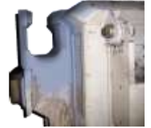
BOX LIFTING BRACKET HIGH STRENGTH (1 PIECE)