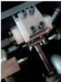
JUNCTION MANIFOLD INSIDE HYD. TANK