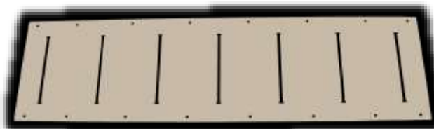
DOG DE-BOUNCE PADS WITH VINYL LINER