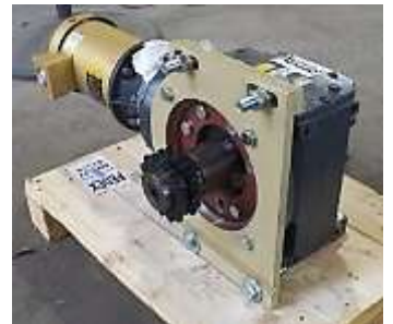
ELECTRIC TURNING MOTOR KIT