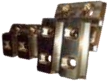
BRONZE BOX GUIDE