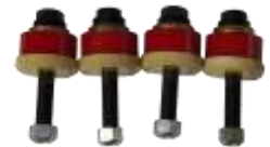
REPLACEMENT SYSTEM FOR SPRING WASHERS

PARTS REPAIRS UPGRADES MACHINERY AUTOMATION