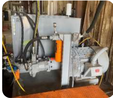
100 HP INJECTION BOOSTER PUMP