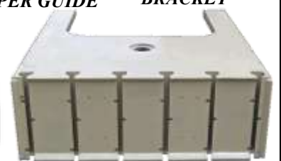
6 TIE FOLLOW BLOCK CONVERSION