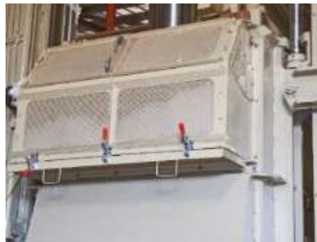
FLY CONTROL BOX