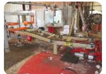
BALE LIFT CONVEYOR TO FIT THE FISHBURNE PRESS & LP BROWN BAGGER