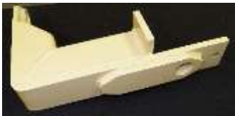
DOG BAR CAM BRACKET HEAVY DUTY