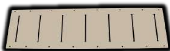
DOG DE-BOUNCE PADS WITH VINYL LINER