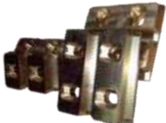
BRONZE BOX GUIDE