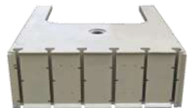
6 TIE FOLLOW BLOCK CONVERSION