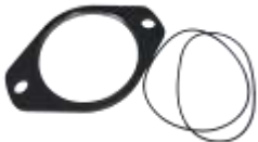
PISTON PUMP SPACER WITH 2-SIDED SEAL