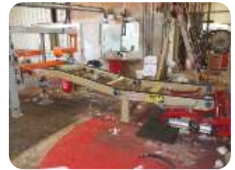
BALE LIFT CONVEYOR TO FIT THE FISHBURNE PRESS & LP BROWN BAGGER