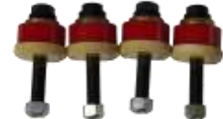
REPLACEMENT SYSTEM FOR SPRING WASHERS

PARTS REPAIRS UPGRADES MACHINERY AUTOMIZATION