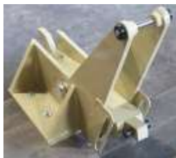
LATCH BAR BRACKET