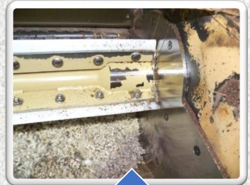
CTC KEYLESS POWER ROLL

At CTC Design, Inc. most projects are repaired, manufactured and assembled locally in a 45,000 sq foot facility complete with boring mill, vertical mill, lathe, CNC plasma table, 175 ton press brake, shear, roll former, computerized saw, sheet metal forming tools and a paint facility. Also, available to us are 5 other specialty shops for precision machining, electrical controls, and laser and Hi-Def plasma cutting.