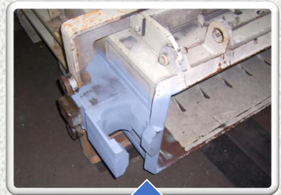
FISHBURNE HEAVY DUTY LIFTING BRACKET