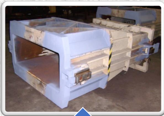
FISHBURNE LIFT BOX BOTTOM RIB