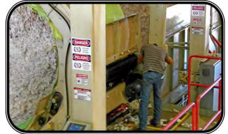
#3 Cut Wrap Thru Slot