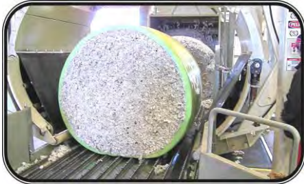
#1 Arms Open/Convey Module In

U.S. PATENT APPROVED 9/21/11 14 CLAIMS AWARDED