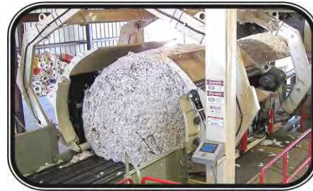
#5 Belts Tilt up to Convey Module Out