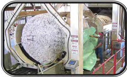
#4 Rotate/Remove Wrap