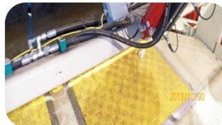
OSHA APPROVED SAFETY MATS