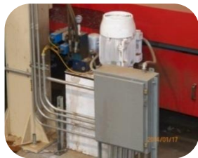
COMPACT 15 HP HYDRAULIC PUMPING UNIT