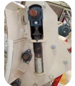
TENSIONER PREVENTS BELT OVERLOAD