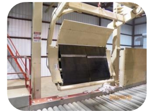
CRADLE IN LOCKED POSITION