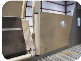
SQUEEZE ROLLERS FOR NARROW FEEDER BEDS