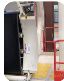
SIDE SHIELDS PREVENT COTTON SPILLAGE