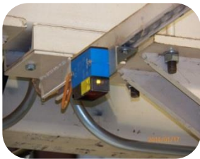
HIGH INTENSITY LASER SENSOR DETECTS MODULE POSITION