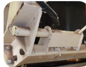
CRADLE SAFETY LOCK