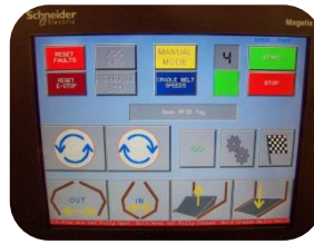
SIMPLIFIED TOUCH SCREEN CONTROLS