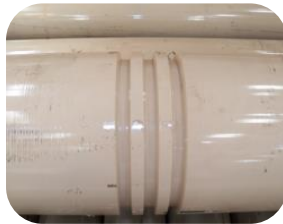
TRIPLE GROOVED BELT GUIDES