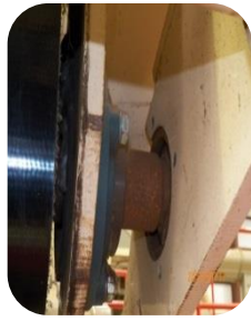
HEAVY DUTY BEARINGS