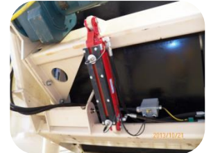
HEAVY DUTY PROX SWITCH MOUNTING SYSTEM