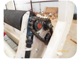
#120 HEAVY DUTY CHAIN & SPROCKET DRIVE (SHOWN WITHOUT GUARD)