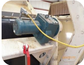
5 HP GEAR MOTOR BELT DRIVE