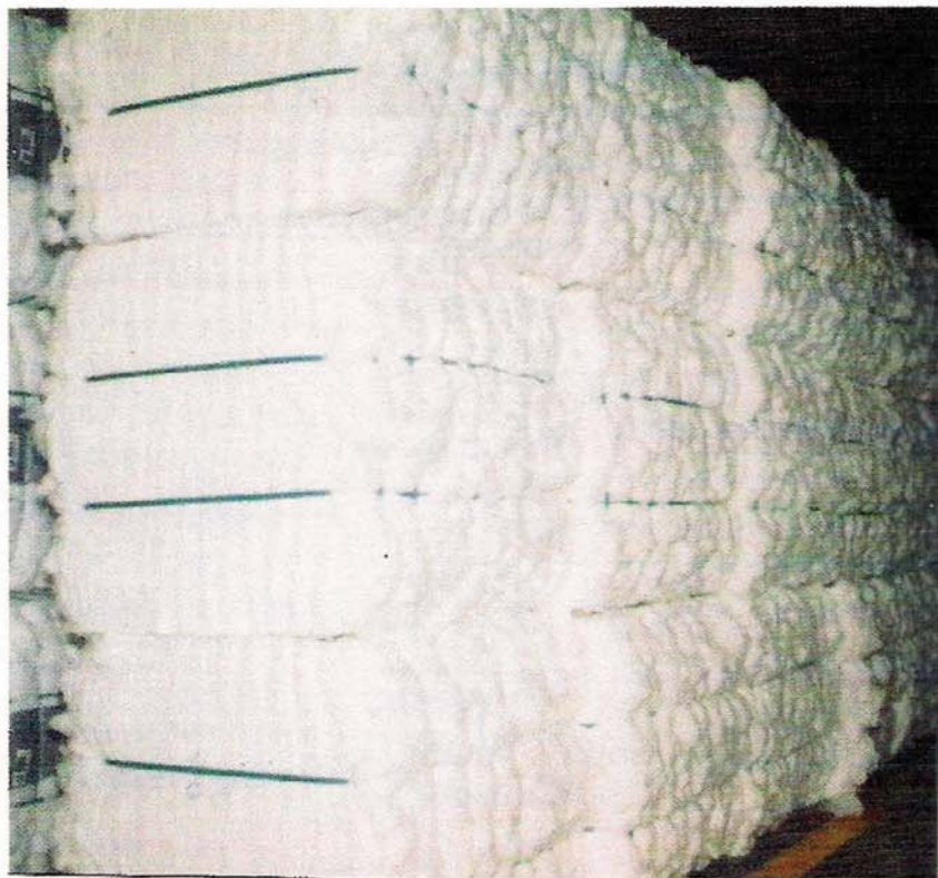
ABOVE: "Cube" Bales in Fovil Warehouse (48" x 48" x 48")